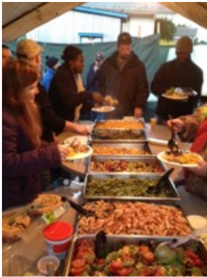
2013 Hot Meals for Tent City 3

GSC maintains an online, user friendly calendar for volunteers to sign up for hot meals. When needed, we help volunteer groups with food cost and finding kitchens where they can cook. We are pleased to report an amazing 69% of all the days in 2013 were covered by a hot meal!